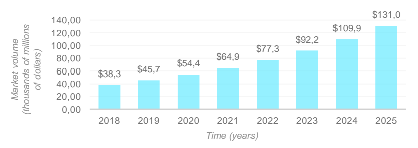
Figure 1: Evolution of the annual global market volume in telemedicine and eHealth<sup>5</sup>

Technological advances in recent years, especially those related to mobile devices and health apps, make it possible to deploy non-face-to-face care solutions and services on a larger scale. The eHealth Action Plan<sup>4</sup> of the European Union (EU) - EU eHealth Action Plan 2012-2020 points out that eHealth tools and solutions have the potential to alleviate the current pressure on health systems due, among other things, to tight public budgets, shortages of professionals, higher incidence of chronic diseases and citizens' growing demand and expectations for accessible and good quality care. Against this background, all countries with advanced economies are rapidly incorporating non-face-to-face care services into health care delivery models. In 2018, the market in telemedicine and eHealth was estimated at 38.3 thousand million dollars, with an estimated annual growth rate of 19.2%, which is why an overall volume of over 130 thousand million dollars is expected for 2025.<sup>5</sup>